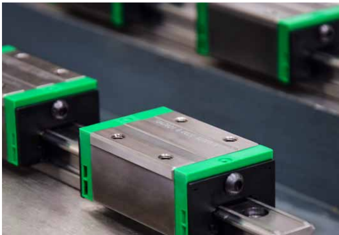
Precision linear guides

We are also happy to offer you this service as part of a maintenance of your machine.