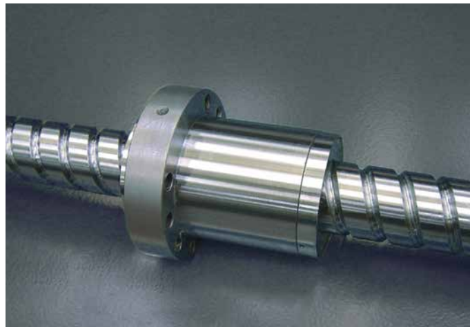
Ball screw drive